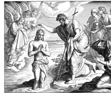
The Baptism of the Lord